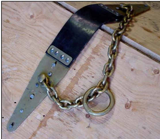
Installation with Nails.

Step 4. For removal provide alternative means of safe roof exit and remove fasteners. HALO Roof Anchors are not designed for permanent installation.