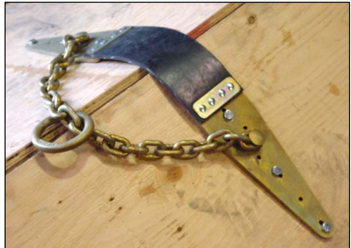
Installation with Lag Screws