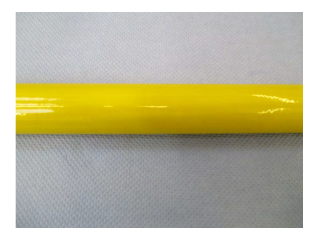
Fig 2: Photograph showing the condition of the 33.7 x 250mm Tube Sample