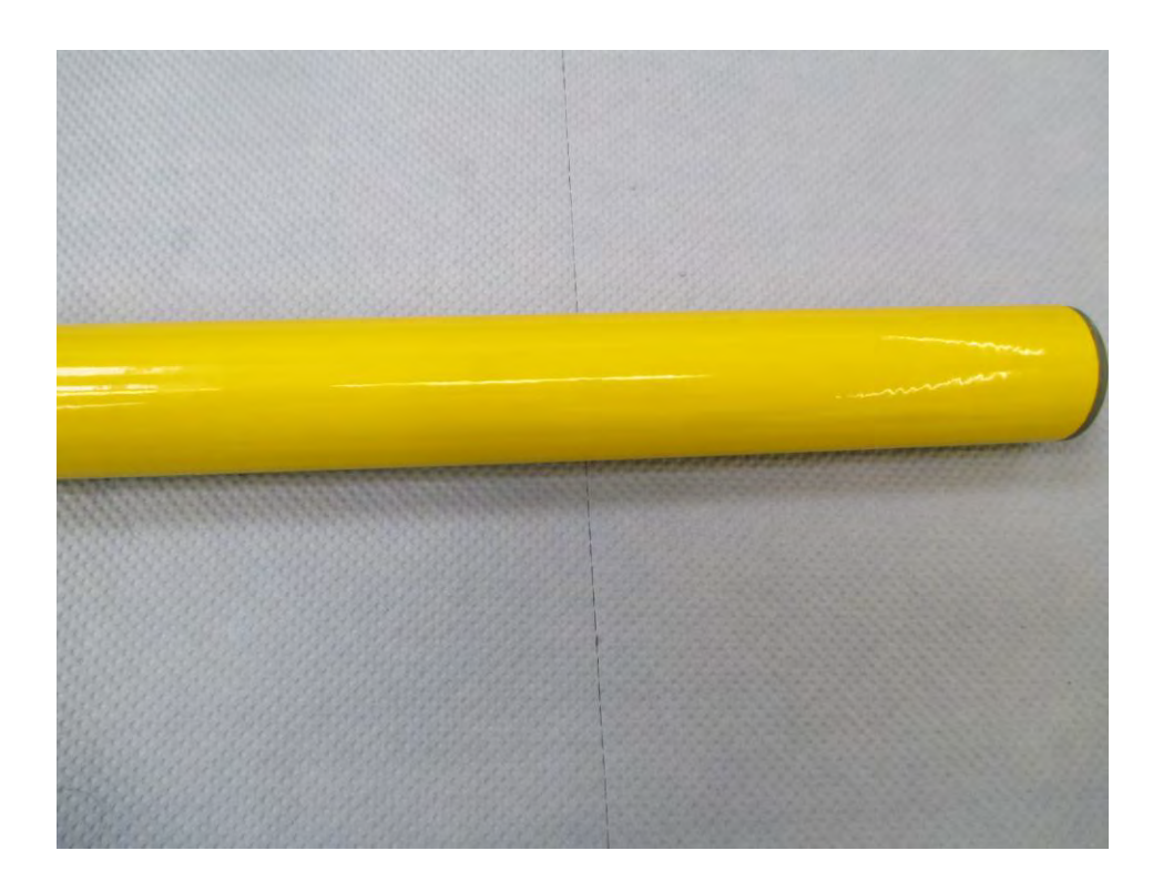
Fig 3: Photograph showing the condition of the 33.7 x 250mm Tube Sample after 216 hours Salt Spray Test