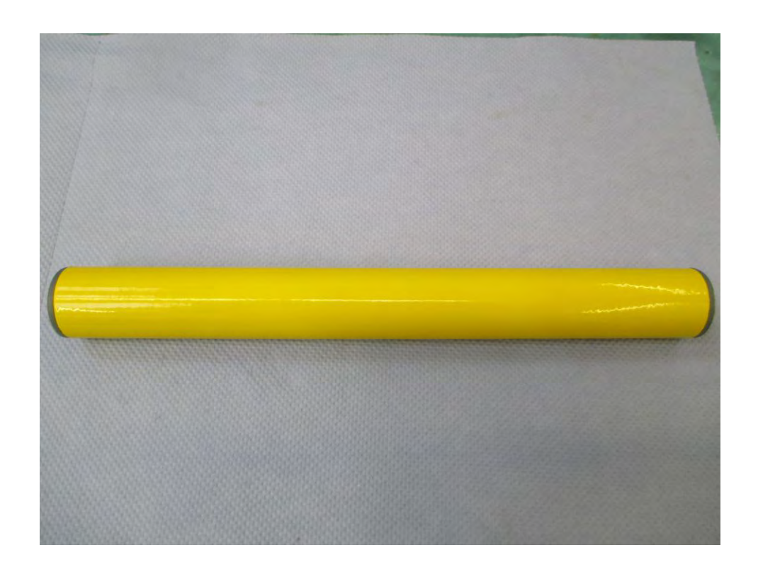
Fig 1: Photograph showing the condition of the 33.7 x 250mm Tube Sample prior to Salt Spray Test